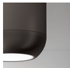
NI Matt nickel